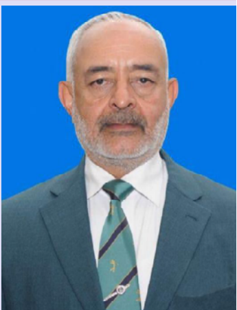
(Admiral D K Joshi)

As we reflect on our collective responsibility, I urge each one of you to champion a sustainable lifestyle. Together, let's pave the way for a brighter, greener, and more equitable future.